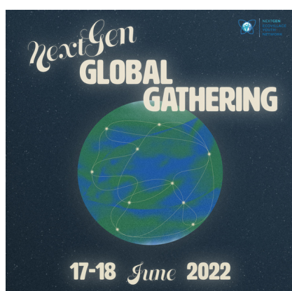
NextGEN Global Gathering poster

The sessions were based on interpersonal connection and network weaving, allowing participants to interact with each other. Participants also had the chance to co-create sessions and host open spaces sharing their skills and talents, such as poetry and music. Overall, the event was a great success and was joined by youths from over 20 countries around the world. In these two days packed with activities, participants heard from communities and sustainable projects all around the globe, connected with each other and learned more about the work of NextGEN in each continent.