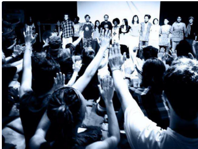
One of the early meetings of NextGEN members

If you are curious to know more about NextGEN's history, we encourage you to visit our super-duper online timeline and read about it there in a more interactive way. More on the timeline project itself can be found further in this report, under the section “Youth Council”.