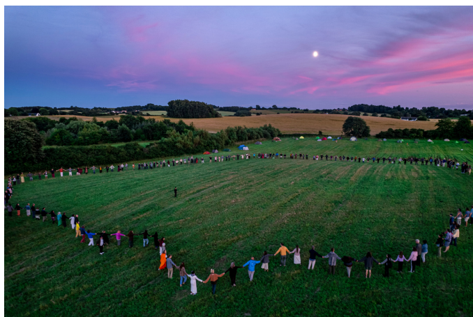
Participants at the European Ecovillage Gathering