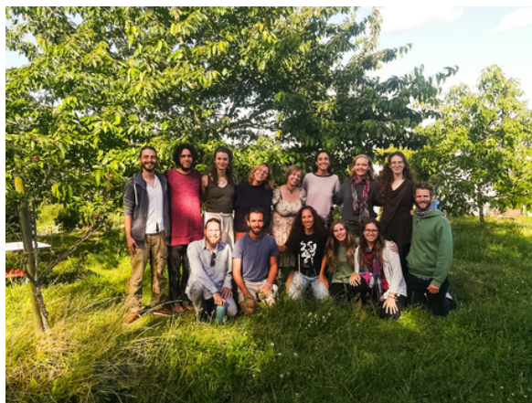
Members of NextGEN at the European Ecovillage Gathering 2022