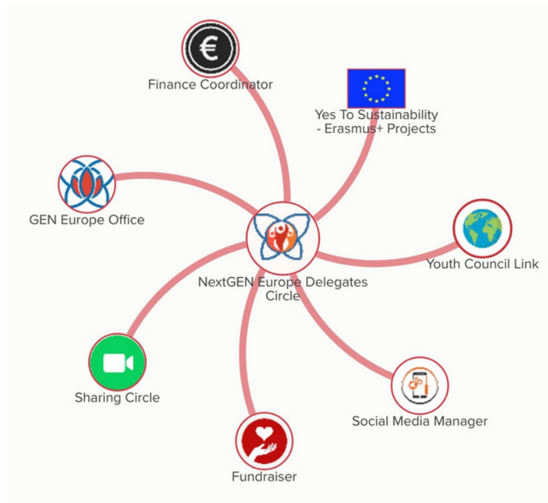
NextGEN Europe organizational map