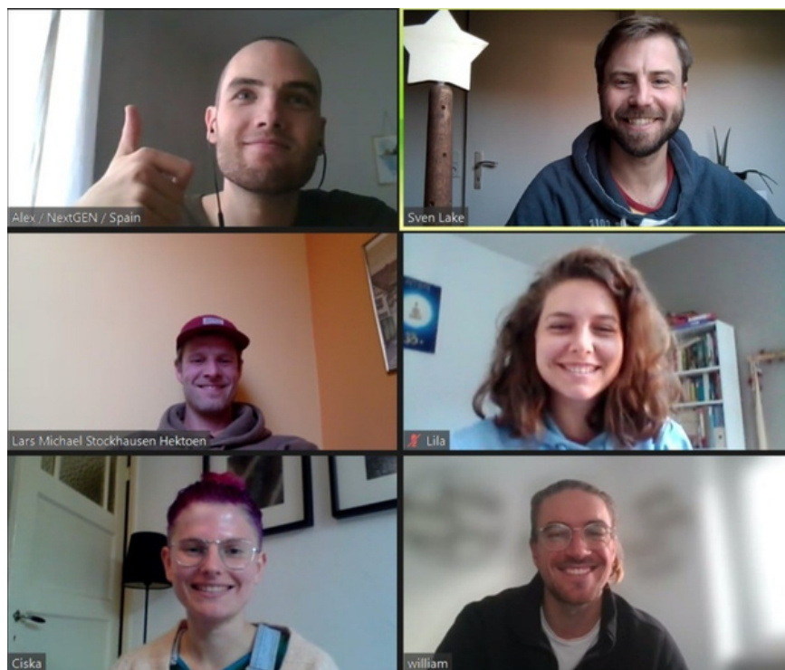
A screenshot from a Sharing Circle