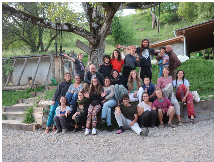
Some of the members of the Yes to Sustainability team during a Team Project Meeting in 2022