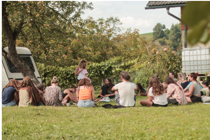
Participants of the From Grey to Green: Sustainability and regeneration through 4 dimensions Youth Exchange in Slovenia