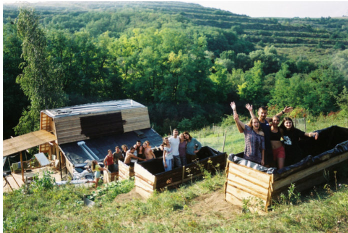
Participants of a YTS Youth Exchange